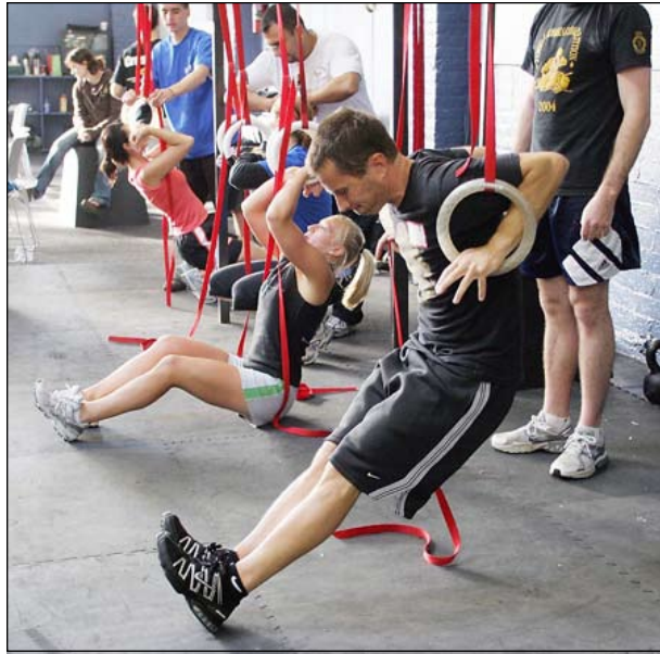
Doing ring pull-ups with a false grip is a good way to get closer to that elusive muscle-up.

For handstand pushups, substituting push-ups with elevated feet is preferable to using a partial range of motion. Plyometric boxes work well, and athletes can place their knees on the box for additional assistance. GHD sit-ups are easily replaced with normal sit-ups. If you want to work GHD sit-ups into your workouts, you can split the set into half GHDs and half regular or Abmat sit-ups. Similarly, back extensions are easy to replace with supermans or good mornings. The Exercises and Demos section of the CrossFit website is rich in videos showing progressions for different movements. Spend time with these videos.